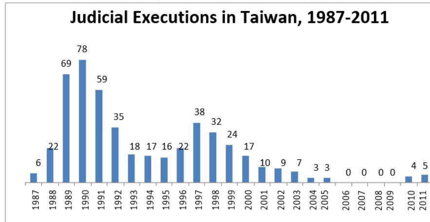
Figure II.1 Judicial Executions in Taiwan, 1987-2011