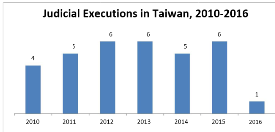
Figure III.1 Judicial Executions in Taiwan, 2010-2016

any executions in her tenure. 44 Despite great public outcry and protest against her, Wang remained steadfast in her determination to halt executions of death row prisoners. Further, Wang stated she would rather “go to hell” and “resign” than carry out executions. 45 Due to public outrage and strong opposition against her, Wang resigned as the Minister of Justice on March 11, 2010. 46 One month later, on April 28, 2010, the incoming Minister of Justice signed off on execution orders for four convicts on death row. 47 The executions were carried out on April 30, 2010, ending Taiwan’s four year and five month de facto moratorium. 48 From that time forward, Taiwan has executed people every year, as shown in Figure III.1 .